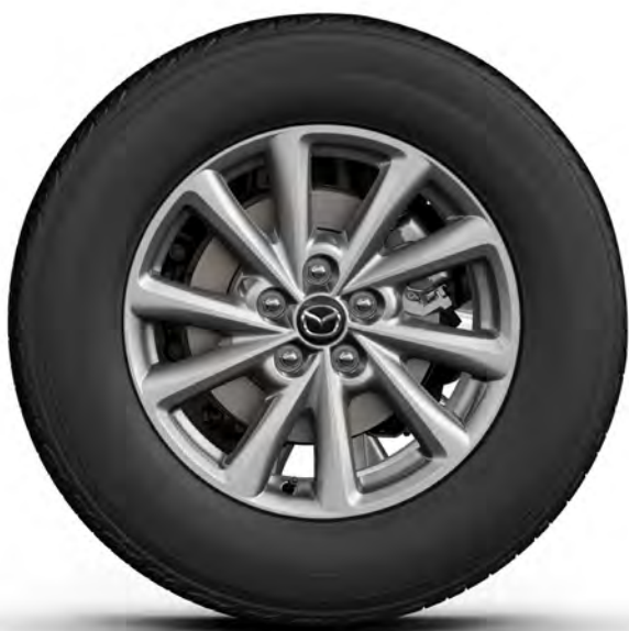
17" Metal Wheels (Silver Metallic)