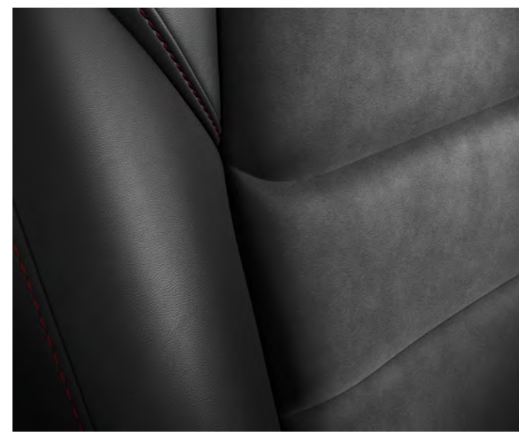
Black Leatherette & Suede Combination