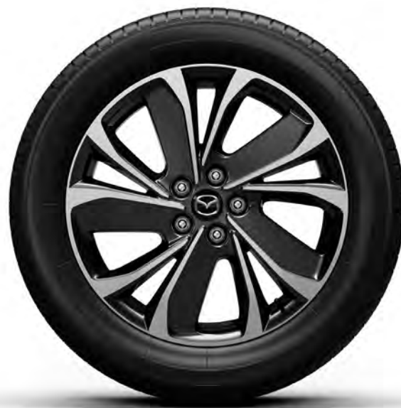
19" Aluminium Wheels (Black Metallic & Machining)