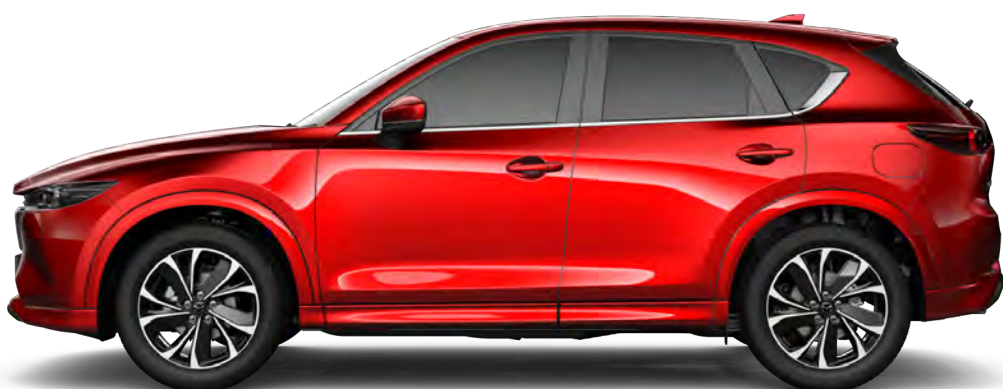
SOUL RED CRYSTAL