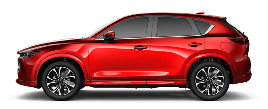
SOUL RED CRYSTAL