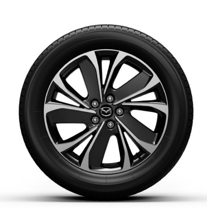
19" Aluminium Wheels (Black Metallic & Machining)