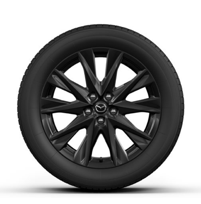
19" Alloy Wheels (Black Metallic)