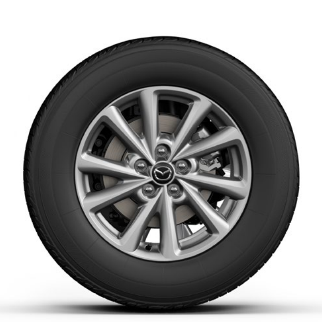
17" Metal Wheels (Silver Metallic)