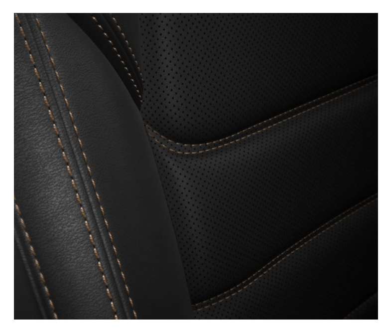
Black Leather with Grey Piping