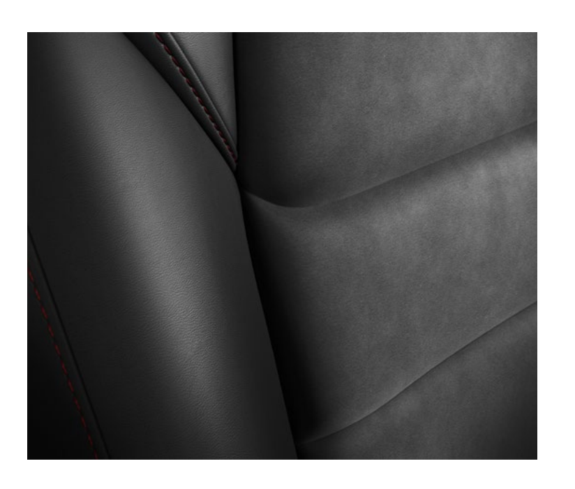
Black Leatherette & Suede Combination